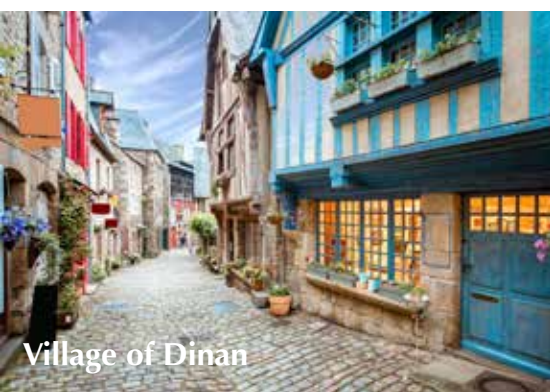
Village of Dinan

Today we visit the fortified and preserved town of Vannes. It harbors a wealth of architectural heritage—ramparts, an almost entirely pedestrianized center, half-timbered houses, and cobbled streets lined with intriguing granite sculptures. This afternoon we arrive at our home